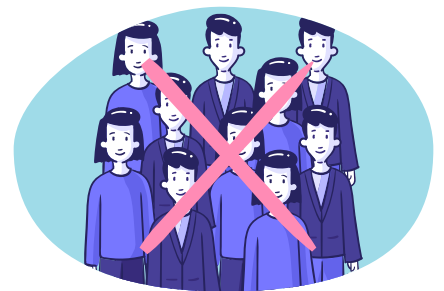
Avoid unnecessary physical contact