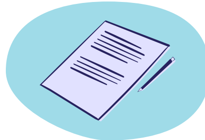
Use your own office materials