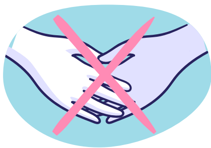
Do not shake hands