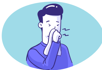
Cough or sneeze into a paper tissue