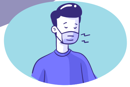
Use protective equipment