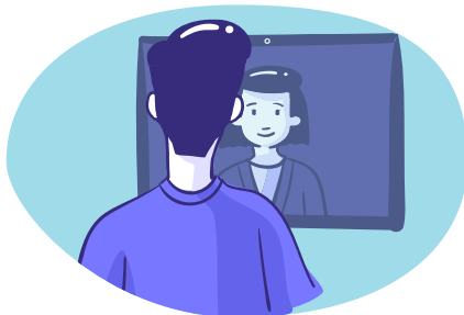
Communicate digitally as much as possible