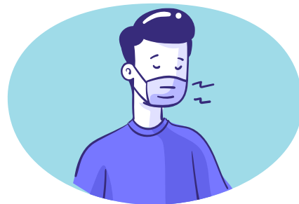
Wear protective equipment and also always provide disinfectant