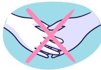
Do not shake hands and avoid unnecessary contact